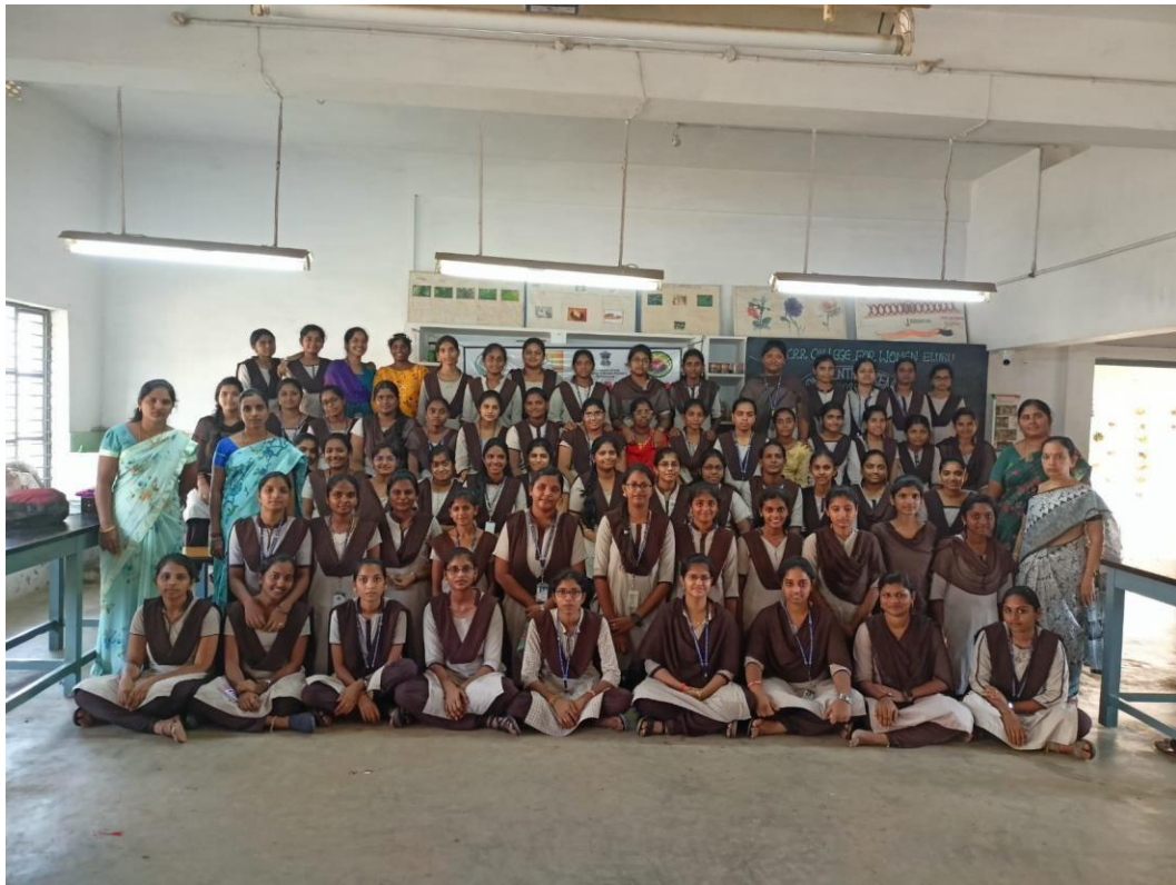
CIIE Cell Members with Students